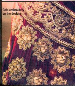
Gold embroidery on the designs