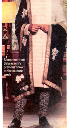
A creation from Sabyasachi's previous show at the couture week

Preview Shree Raj Mahal Jewellers India Couture Week 2014 in association with Logix Group