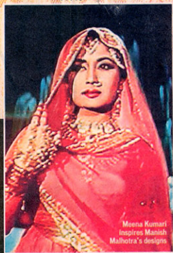
Meena Kumari inspires Manish Malhotra's designs

B ig on bride, bigger on opulence, and grand in presentation — it's time for couture to hit the Capital. Shree Raj Mahal Jewellers India Couture Week 2014 in association with Logix Group and helmed by the Fashion Design Council of India starts today and will go on till July 20, at the Taj Palace hotel. Apart from ramp shows, installations and celeb power, there's also an outstation show by designer Anamika Khanna at the end of the month in Kolkata. Here's a glimpse into what all to expect from our couturiers.